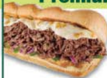
Big Philly Cheesesteak