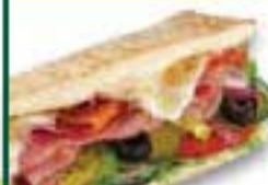
Italian B.M.T.® on Flatbread